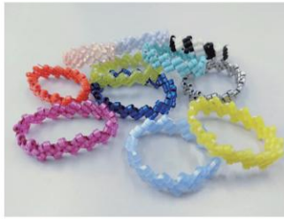
PEACE RING ( S · M · L ) 700 TOHO CO., LTD. 082-237-5151 http://www.toho-beads.co.jp