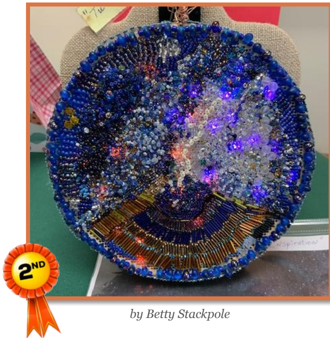
by Betty Stackpole