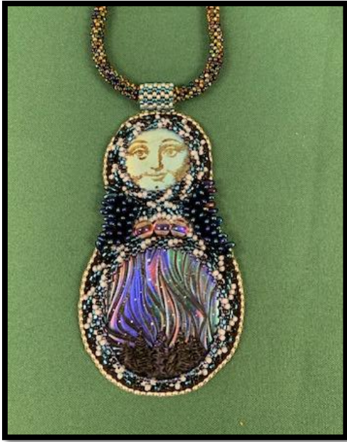
by Clare Pramuk