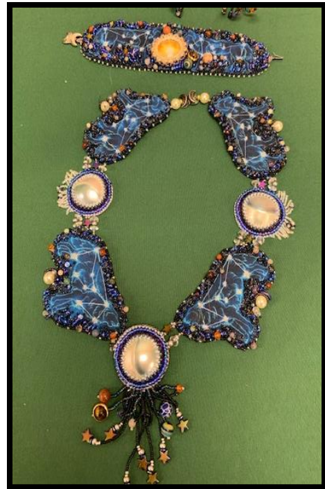
by Sue Urbanek